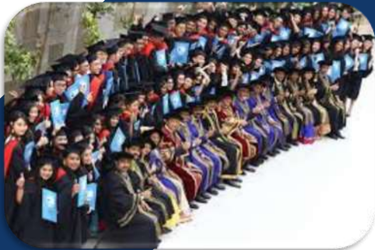
Proud PIDC Students on their Graduation Day at The Grand Ballroom, MAHSA University December 2022