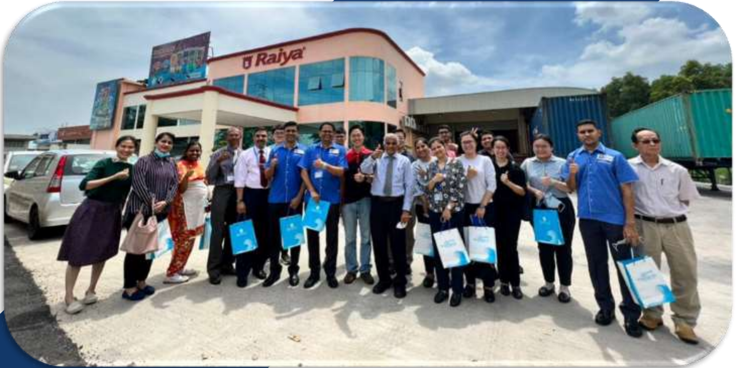
Faculty Industry Visit to Raiya Oral Healthcare Product Manufacturer, Penang May 2022