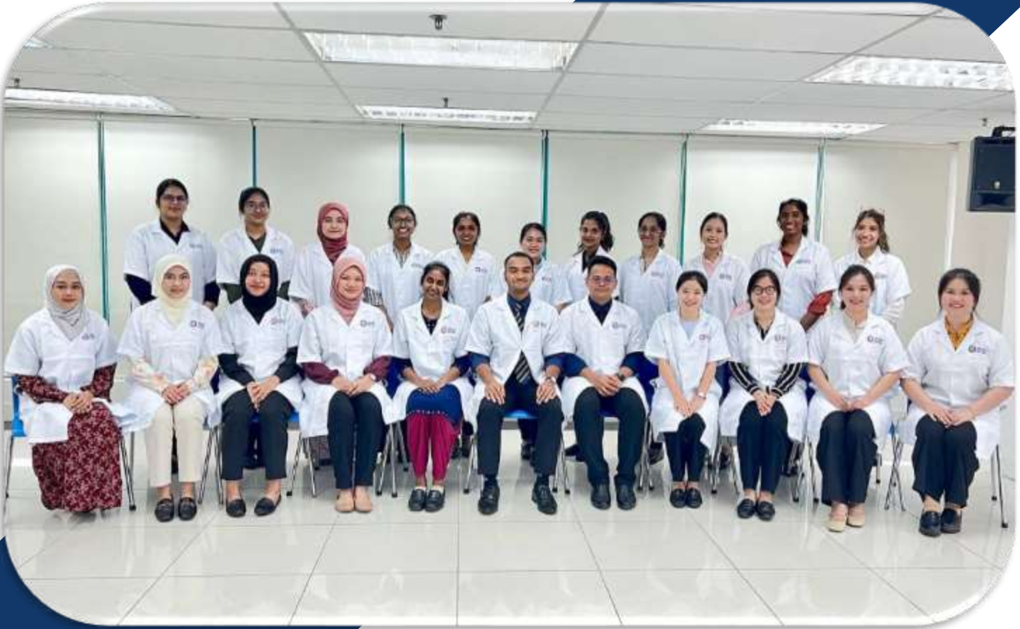
Class of 2025 Joins PIDC Campus for Year 3, 4 & 5 Clinical Training November 2022