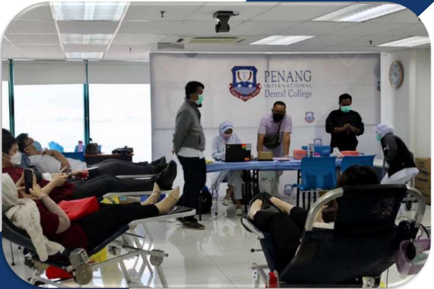
Student Council of PIDC Collaborated with KKM, Butterworth to Conduct One of the Blood Donation Drives at PIDC April 2022