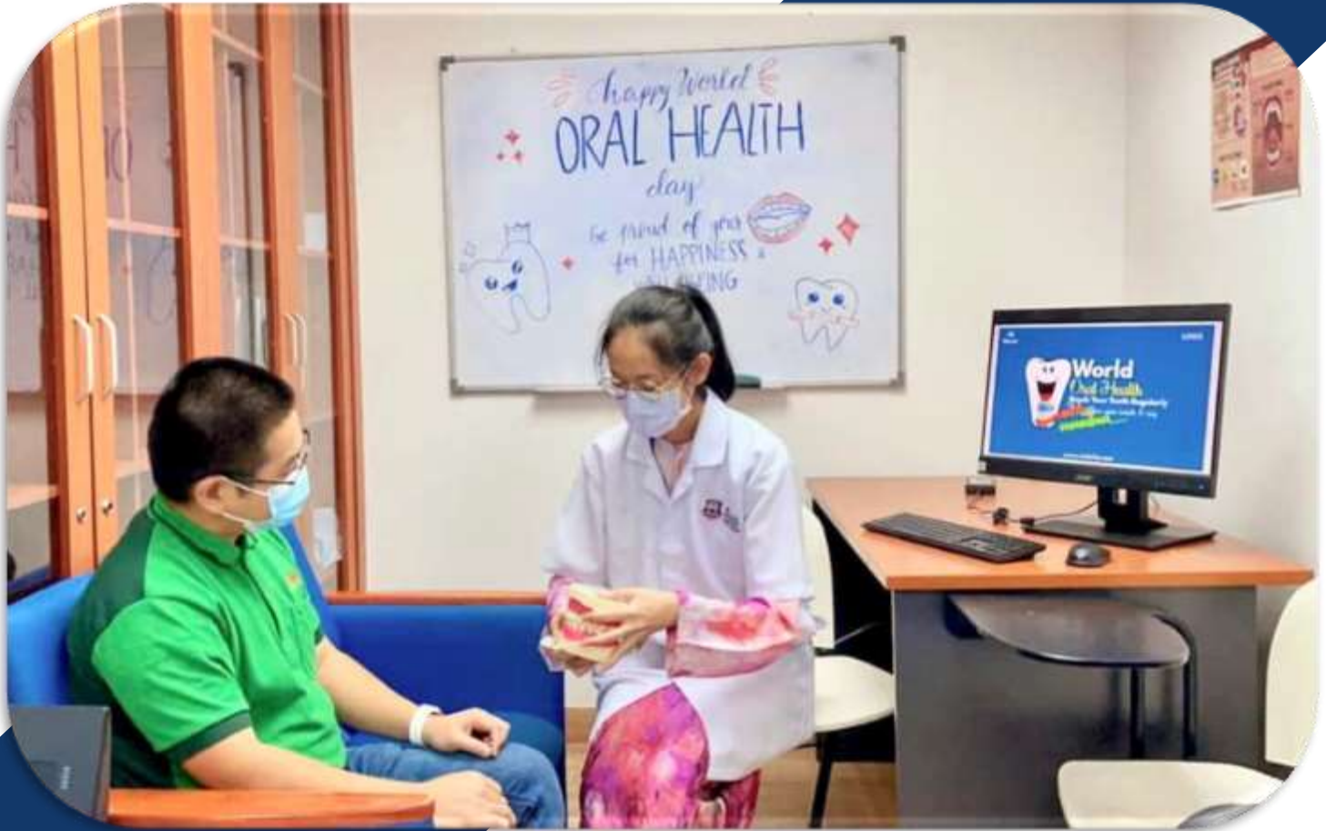
Celebrating World Oral Health Day Students conducting Oral Health Education & Oral Health Promotion campaign March 2022